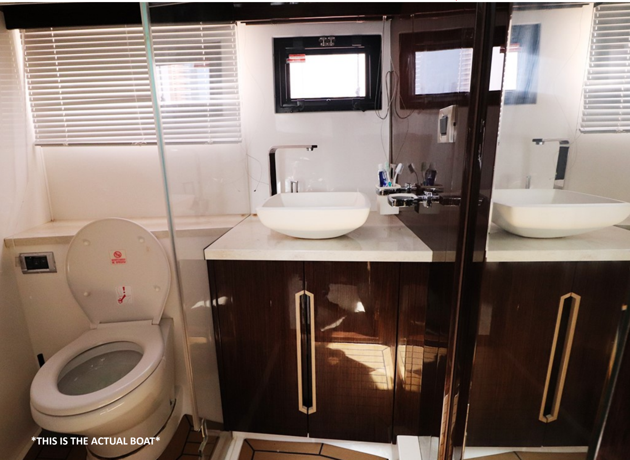
*THIS IS THE ACTUAL BOAT*