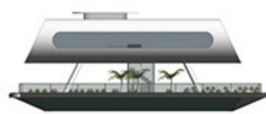
PORT SIDE VIEW