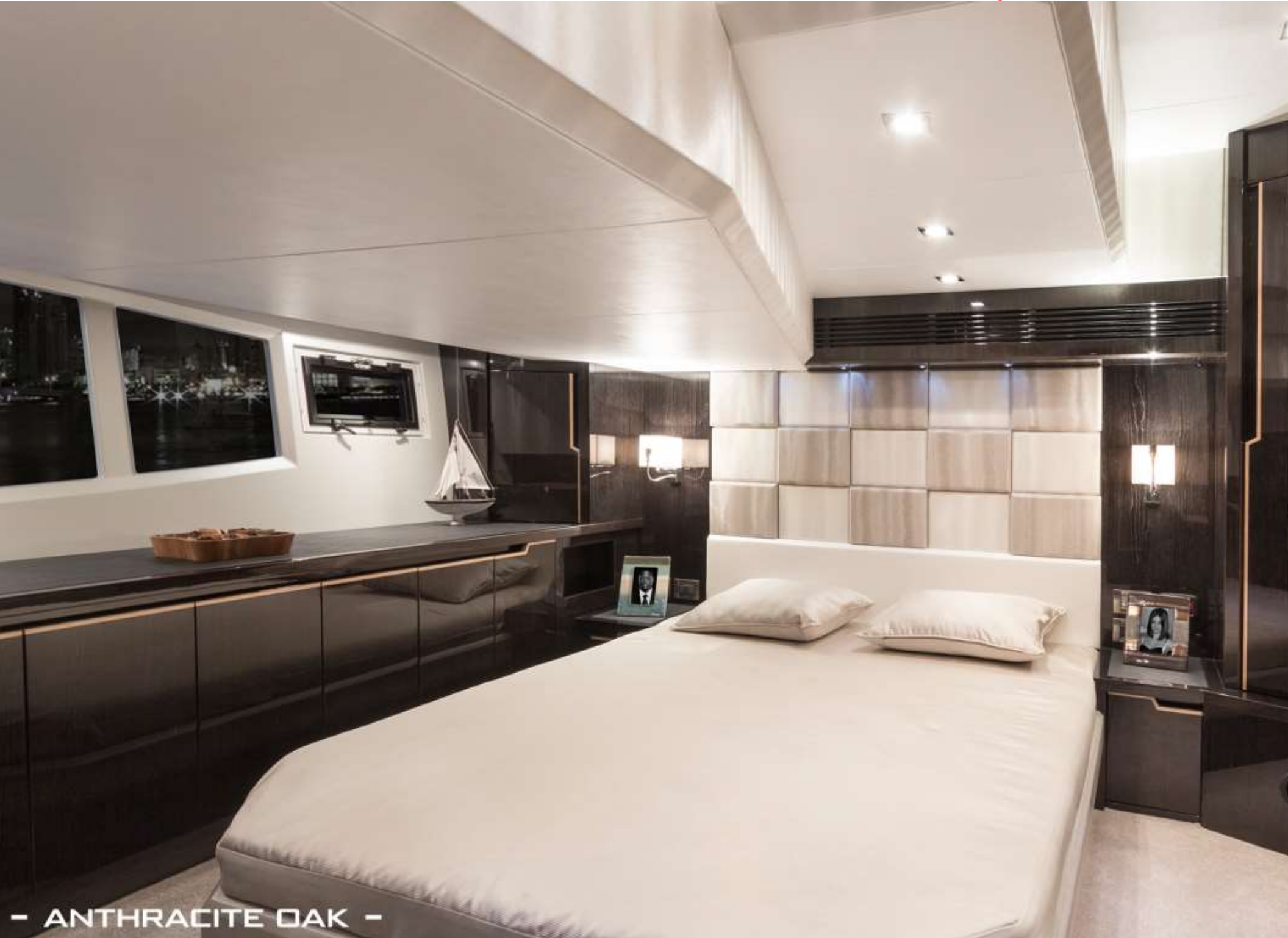
- ANTHRACITE OAK -