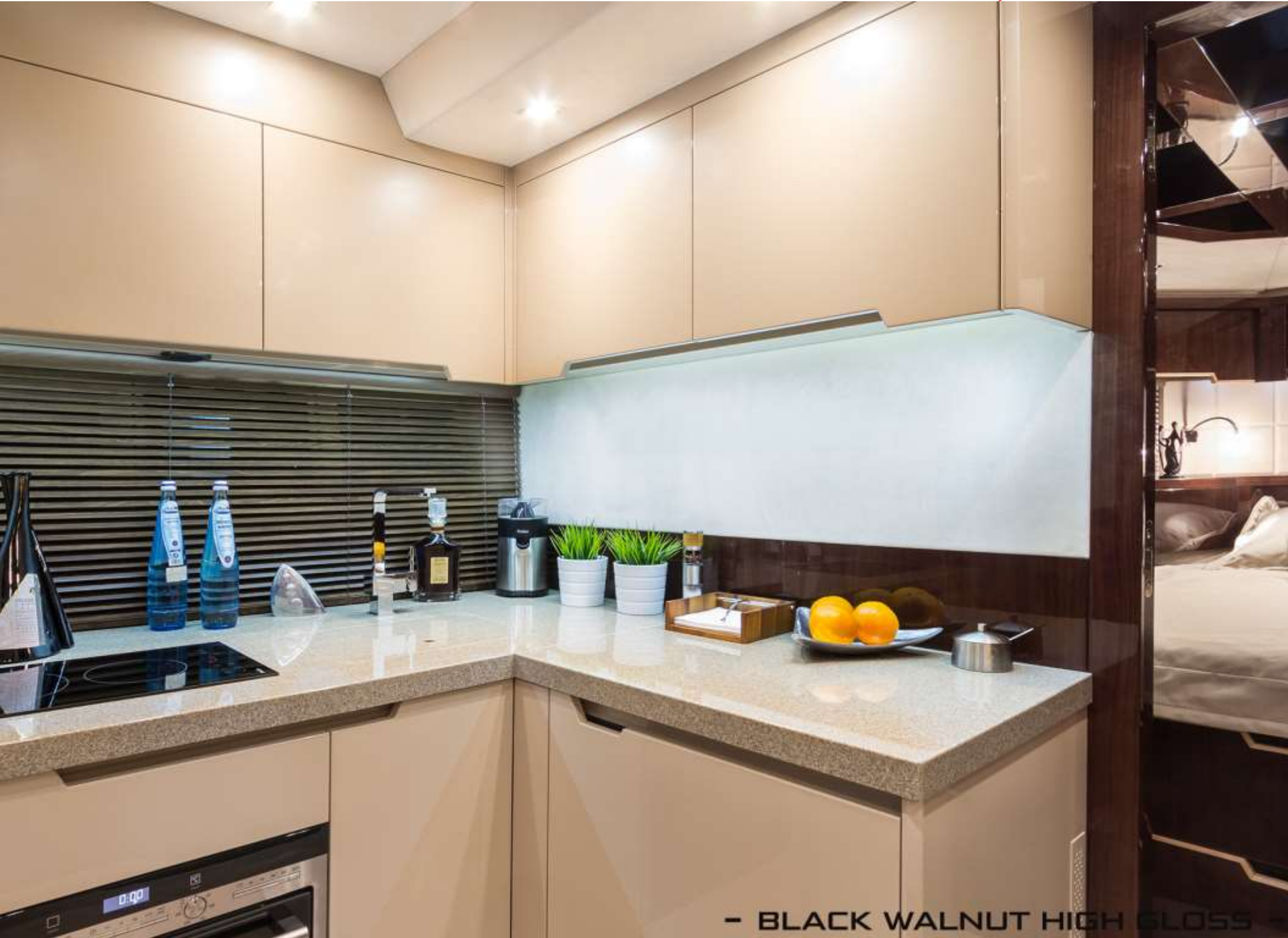
- BLACK WALNUT HIGH GLOSS