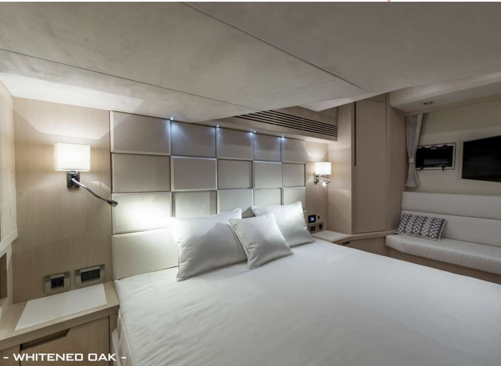
- WHITENED OAK -