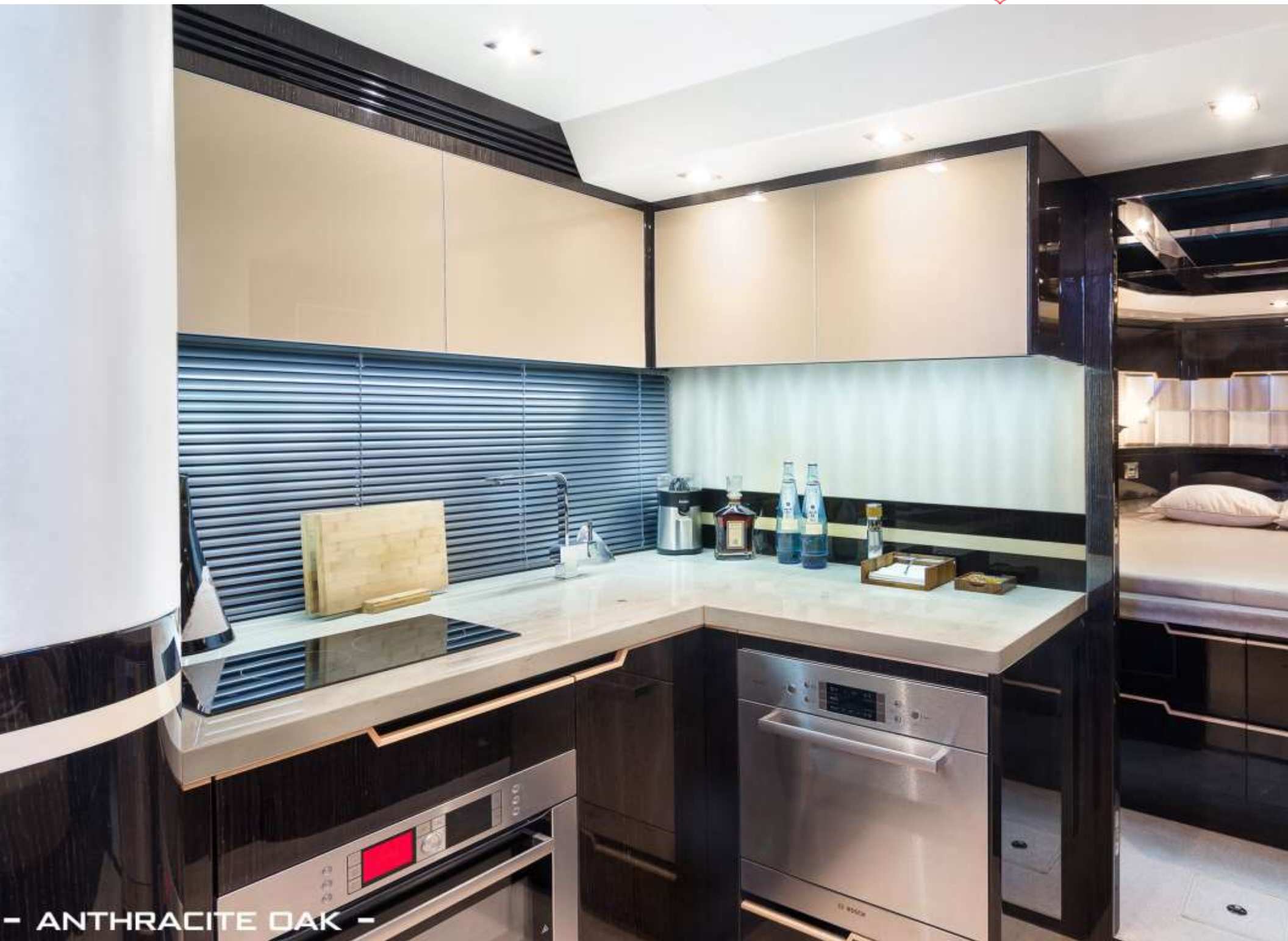
- ANTHRACITE OAK -