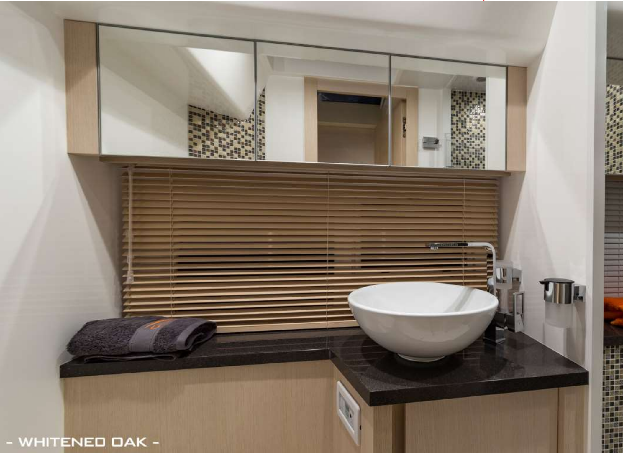
- WHITENED OAK -