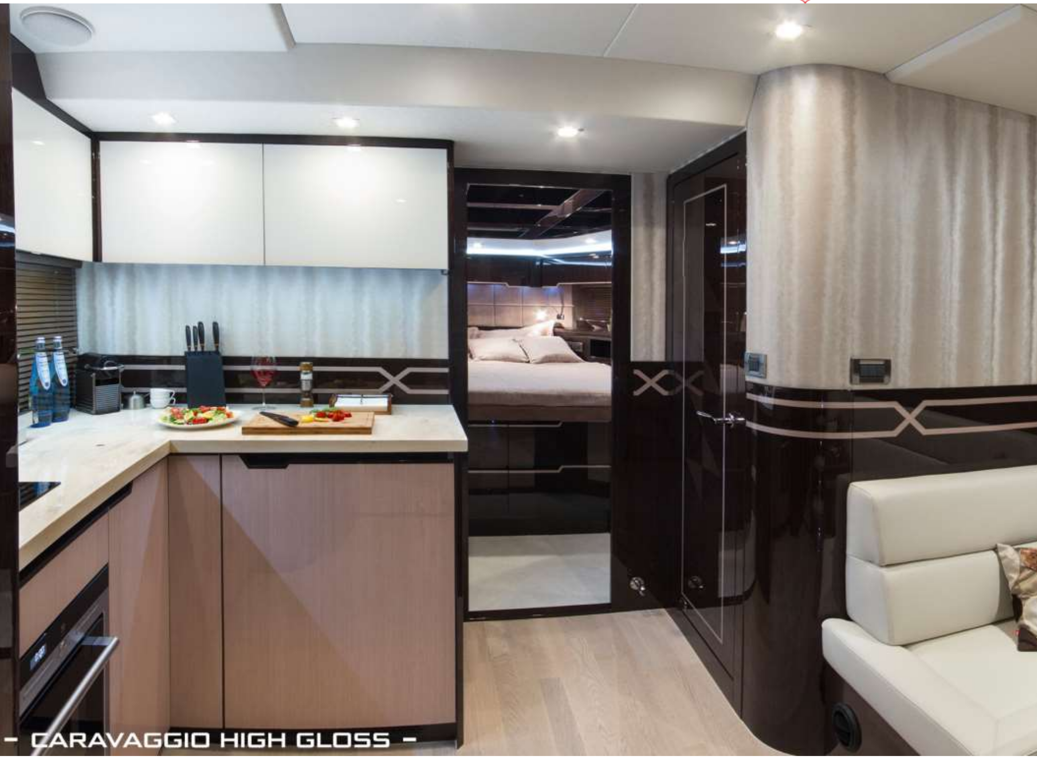
- CARAVAGGIO HIGH GLOSS -