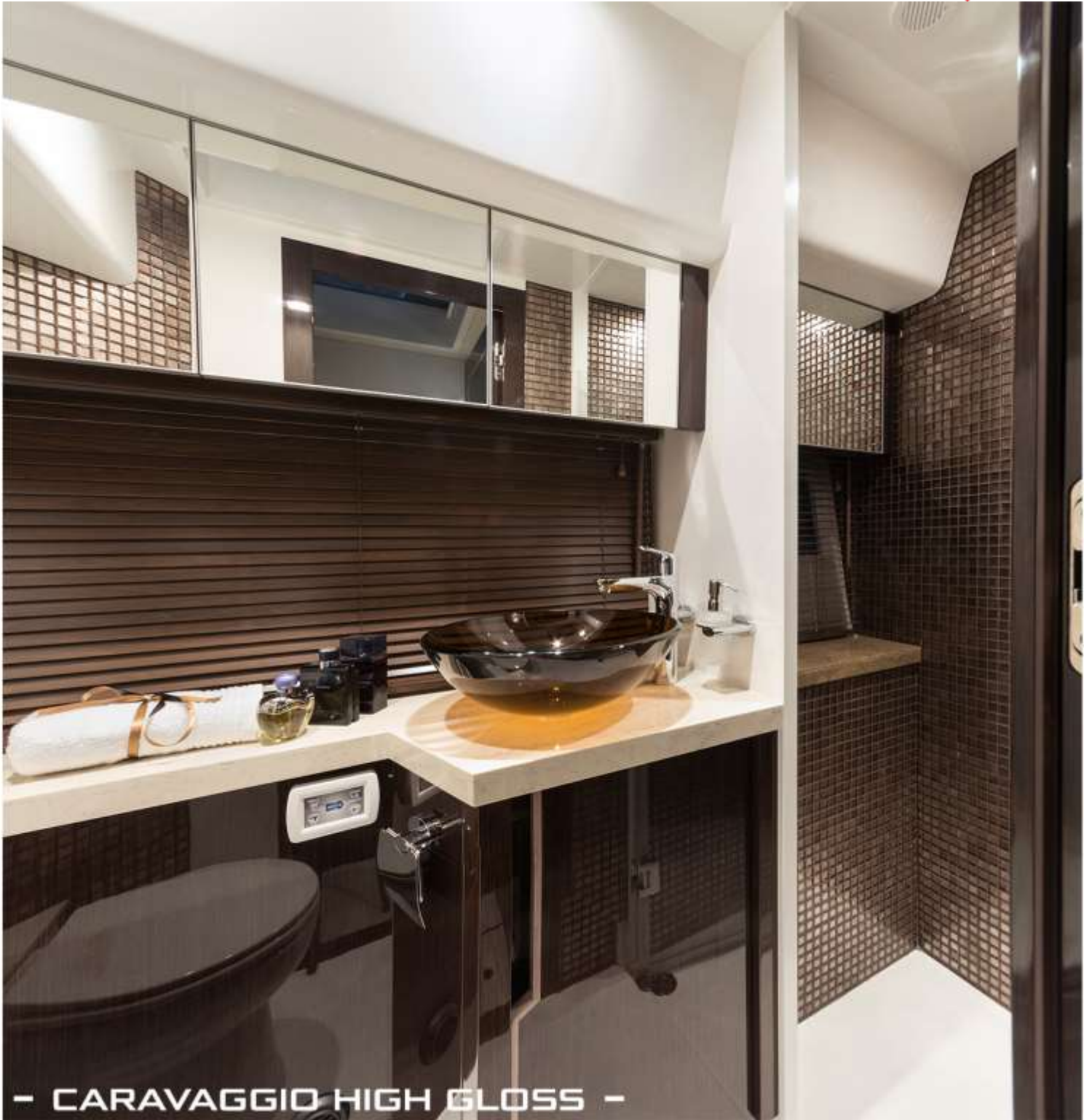
- CARAVAGGIO HIGH GLOSS -