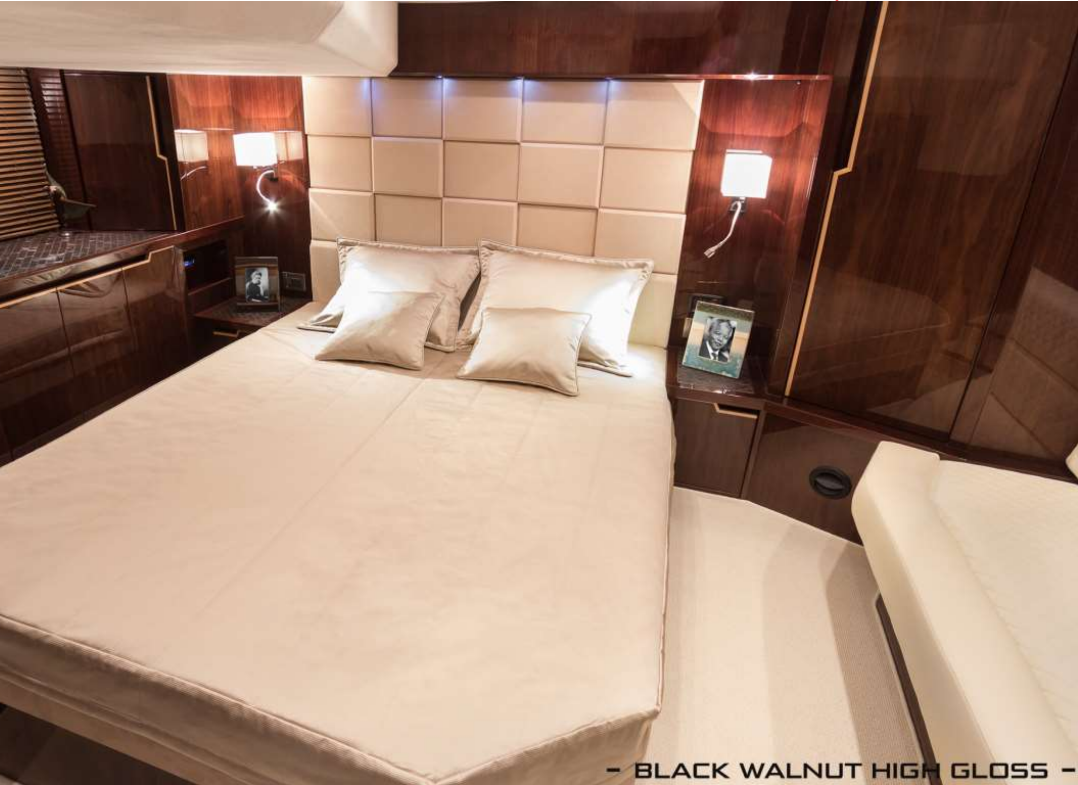
- BLACK WALNUT HIGH GLOSS -