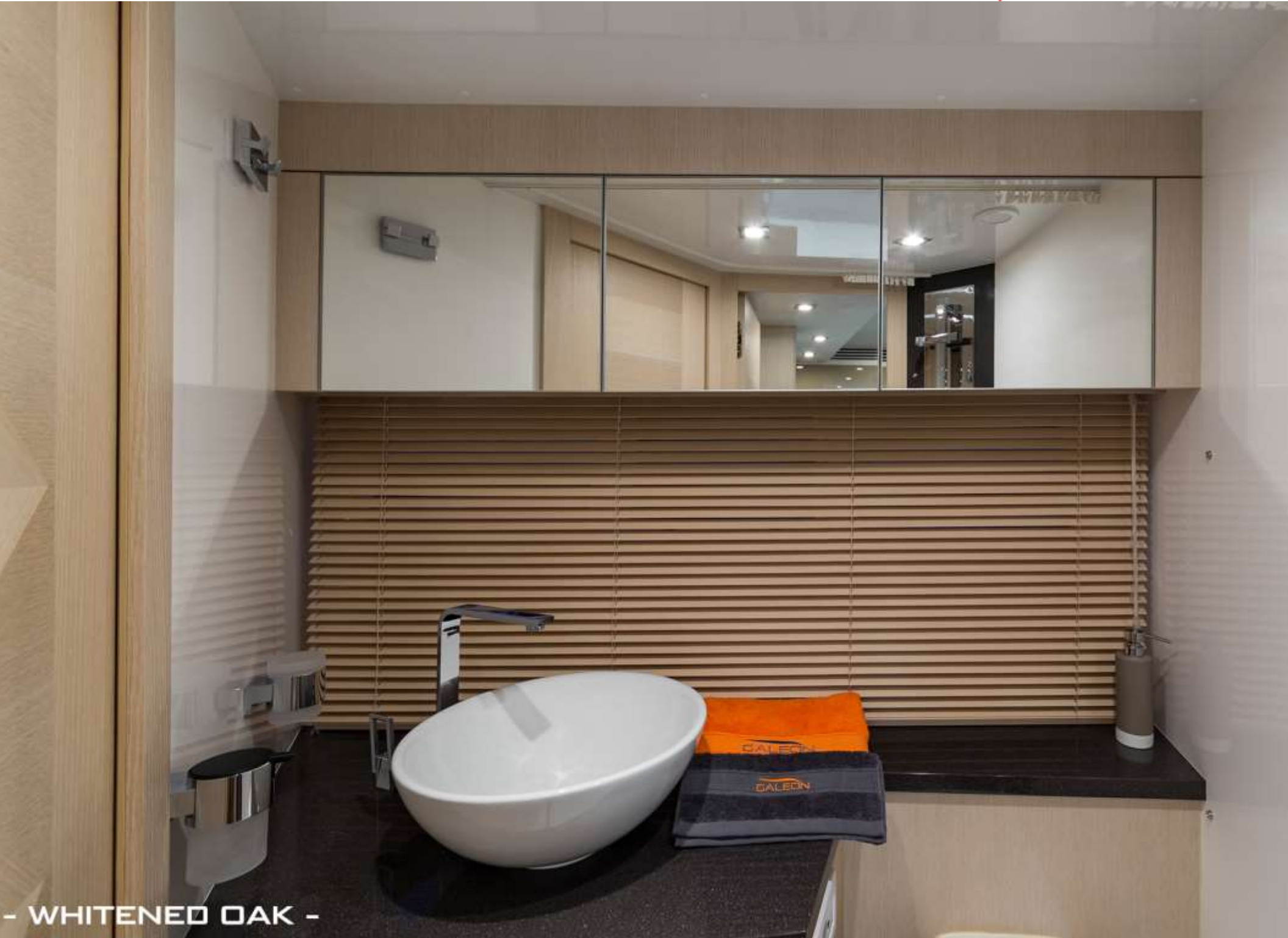
- WHITENED OAK -