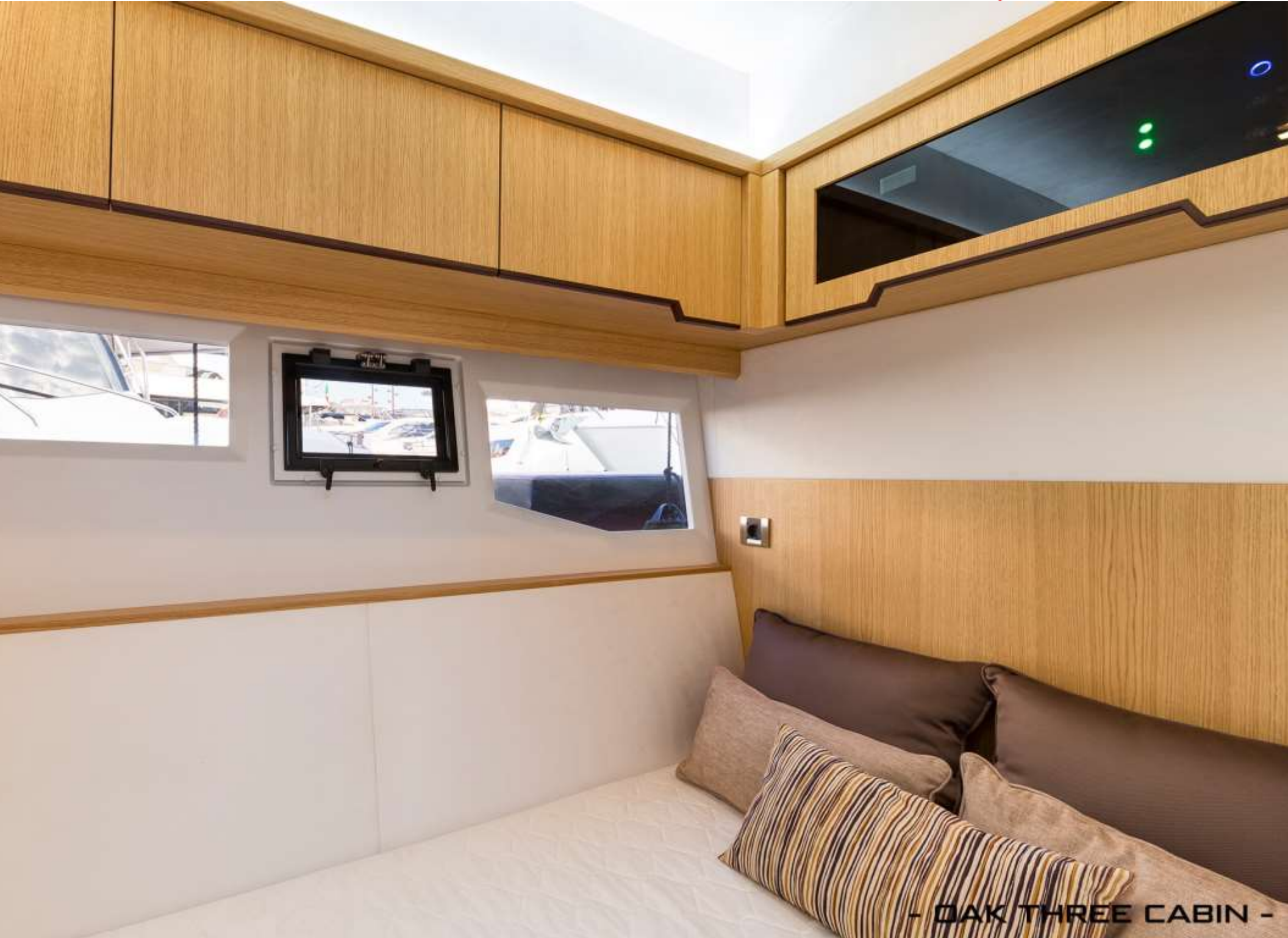
- OAK THREE CABIN -