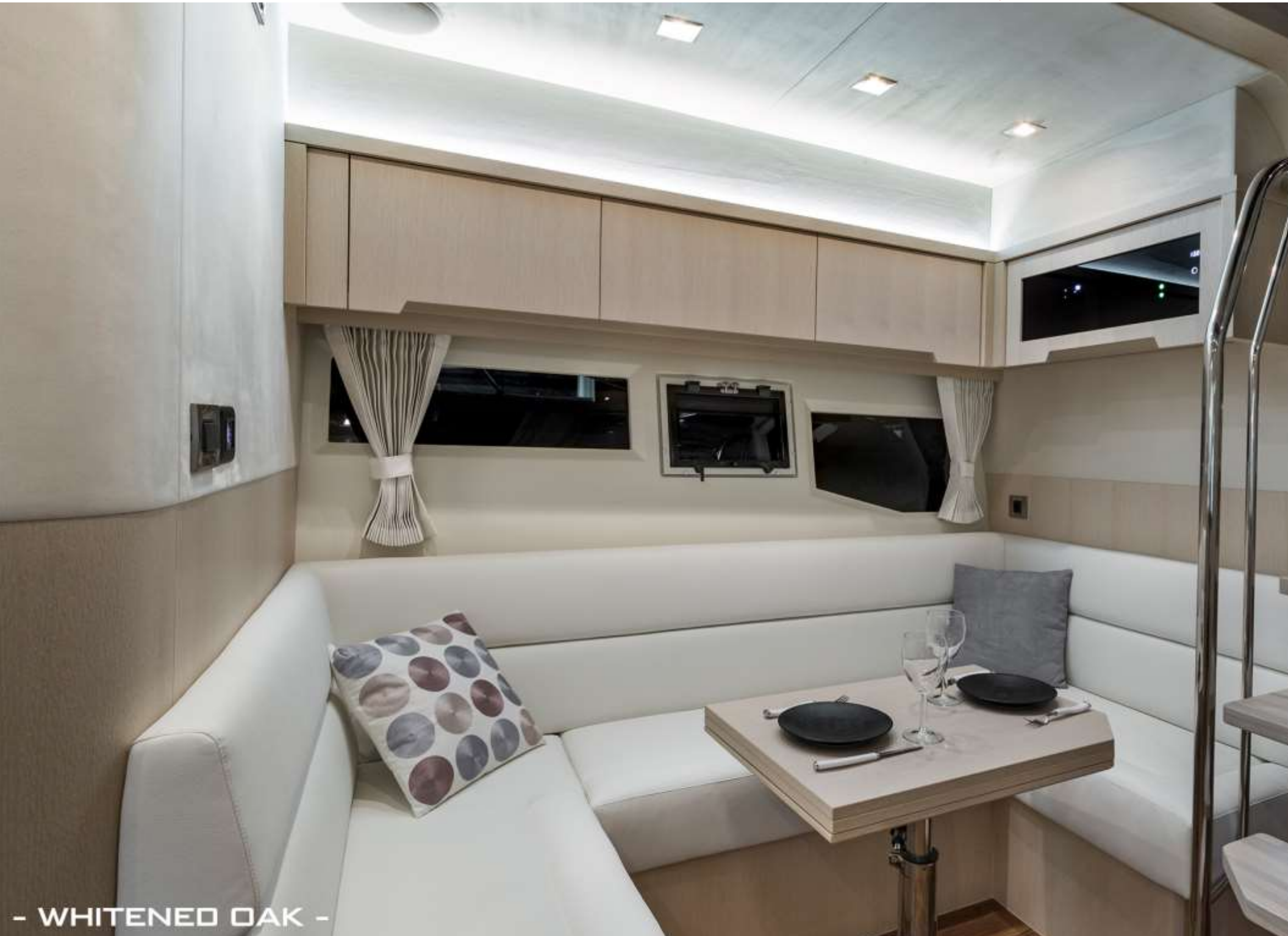
- WHITENED OAK -