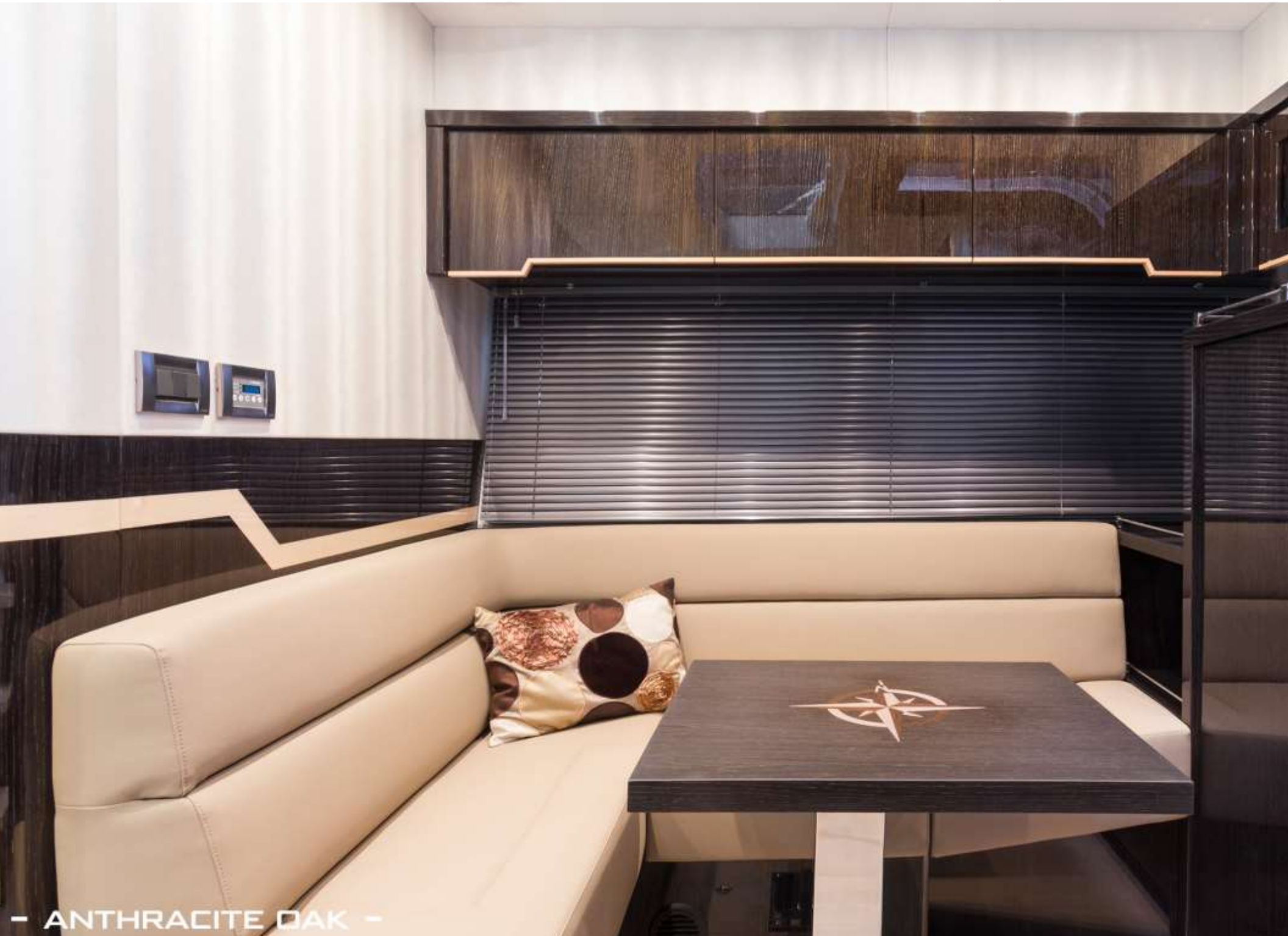
- ANTHRACITE OAK -