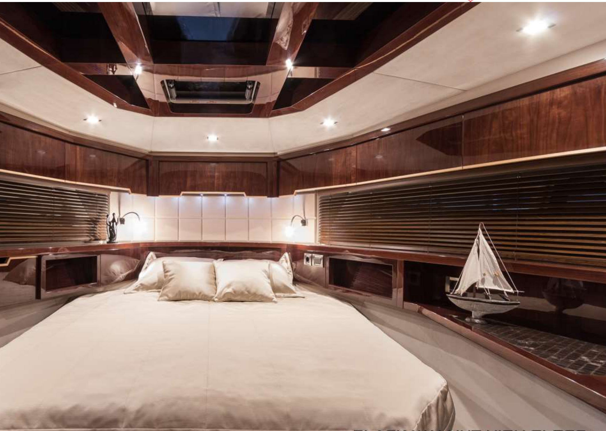
- BLACK WALNUT HIGH GLOSS -