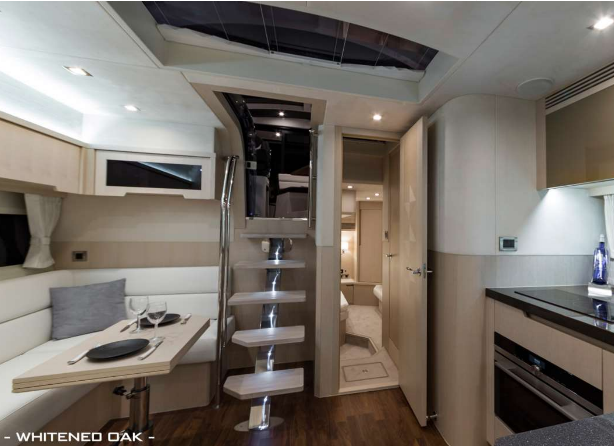
- WHITENED OAK -