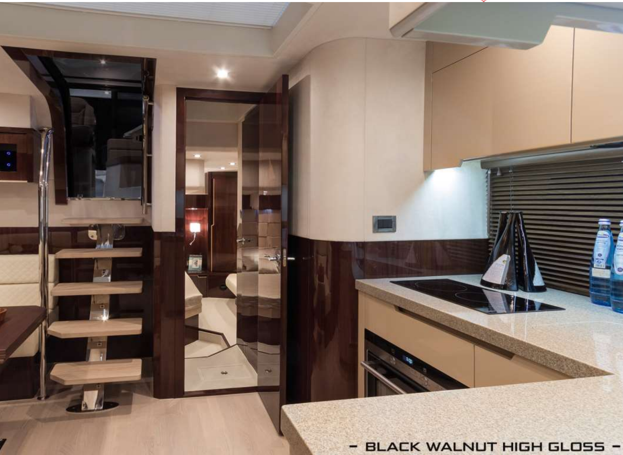
- BLACK WALNUT HIGH GLOSS -