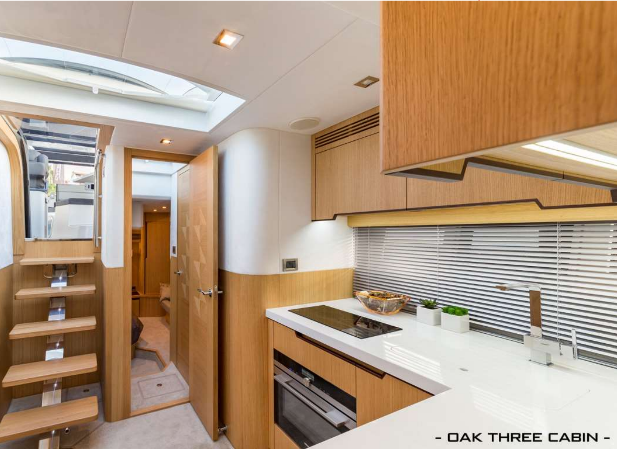
- OAK THREE CABIN -