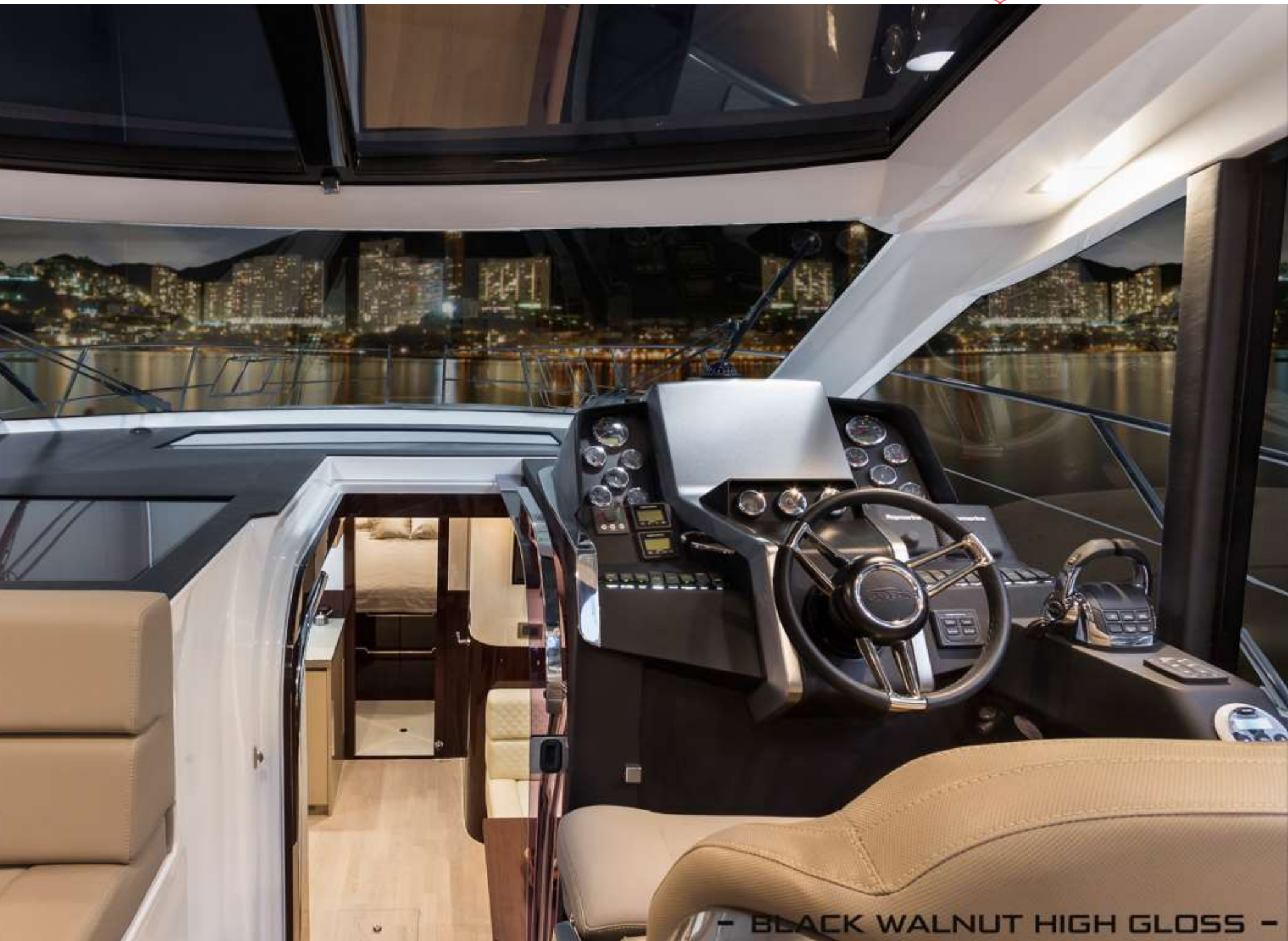
- BLACK WALNUT HIGH GLOSS -