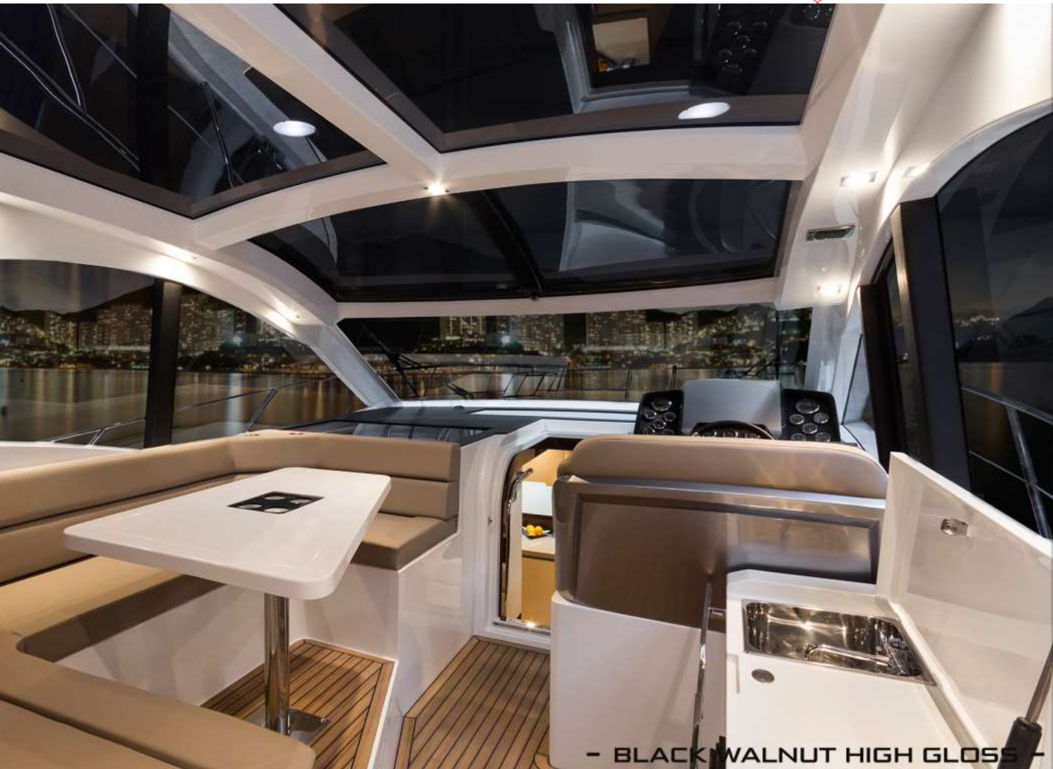
- BLACK WALNUT HIGH GLOSS -