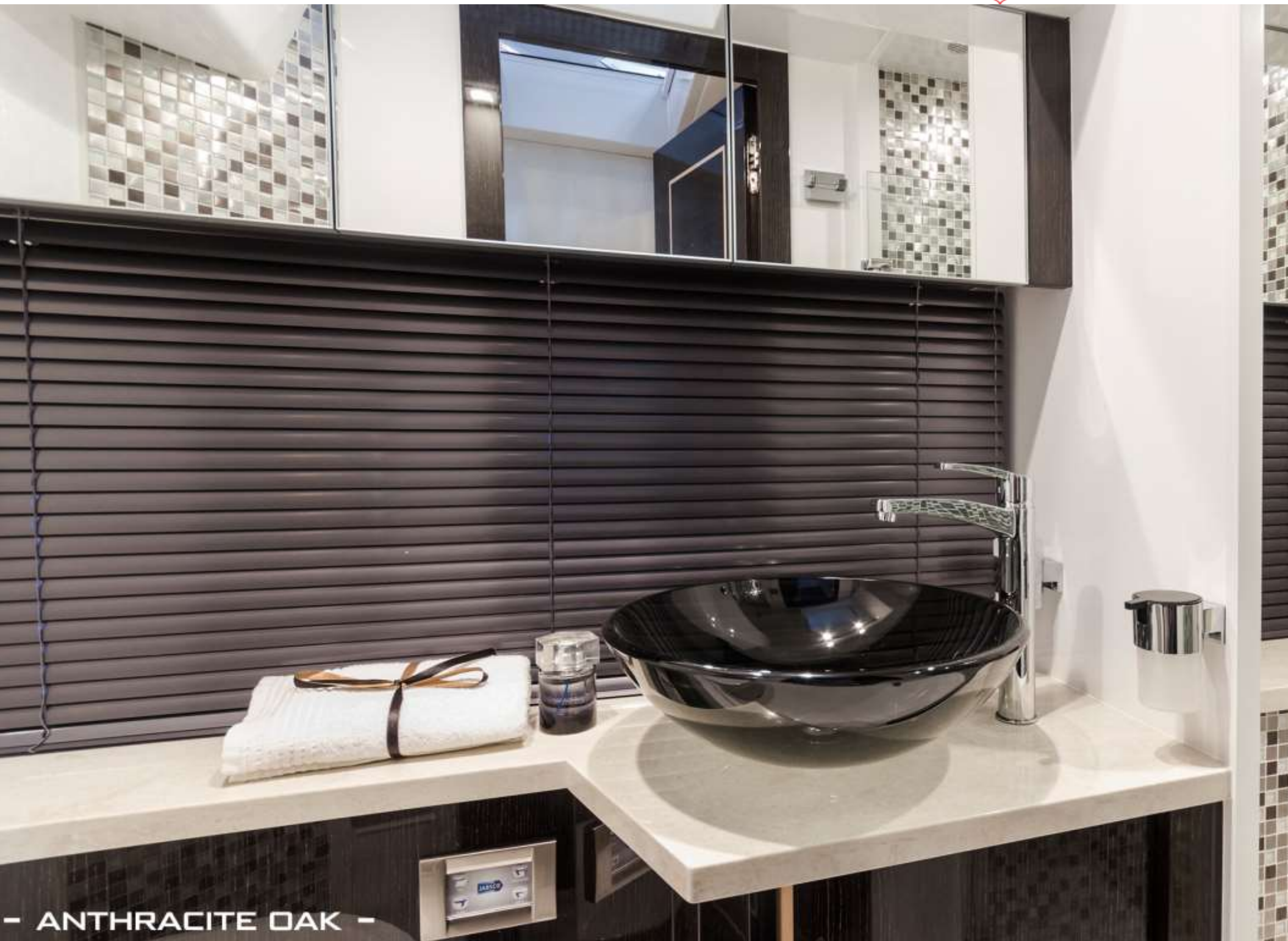
- ANTHRACITE OAK -