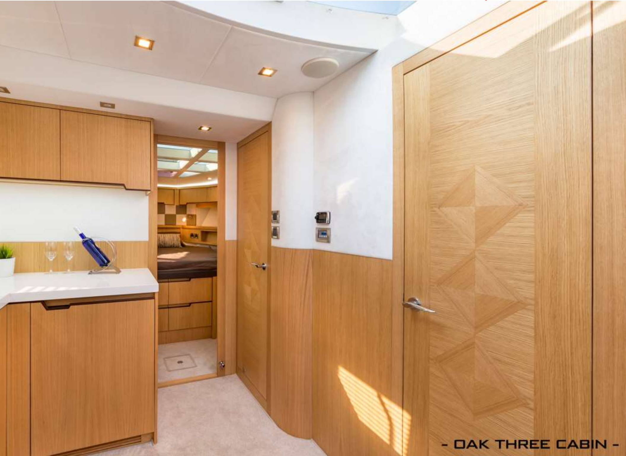
- OAK THREE CABIN -