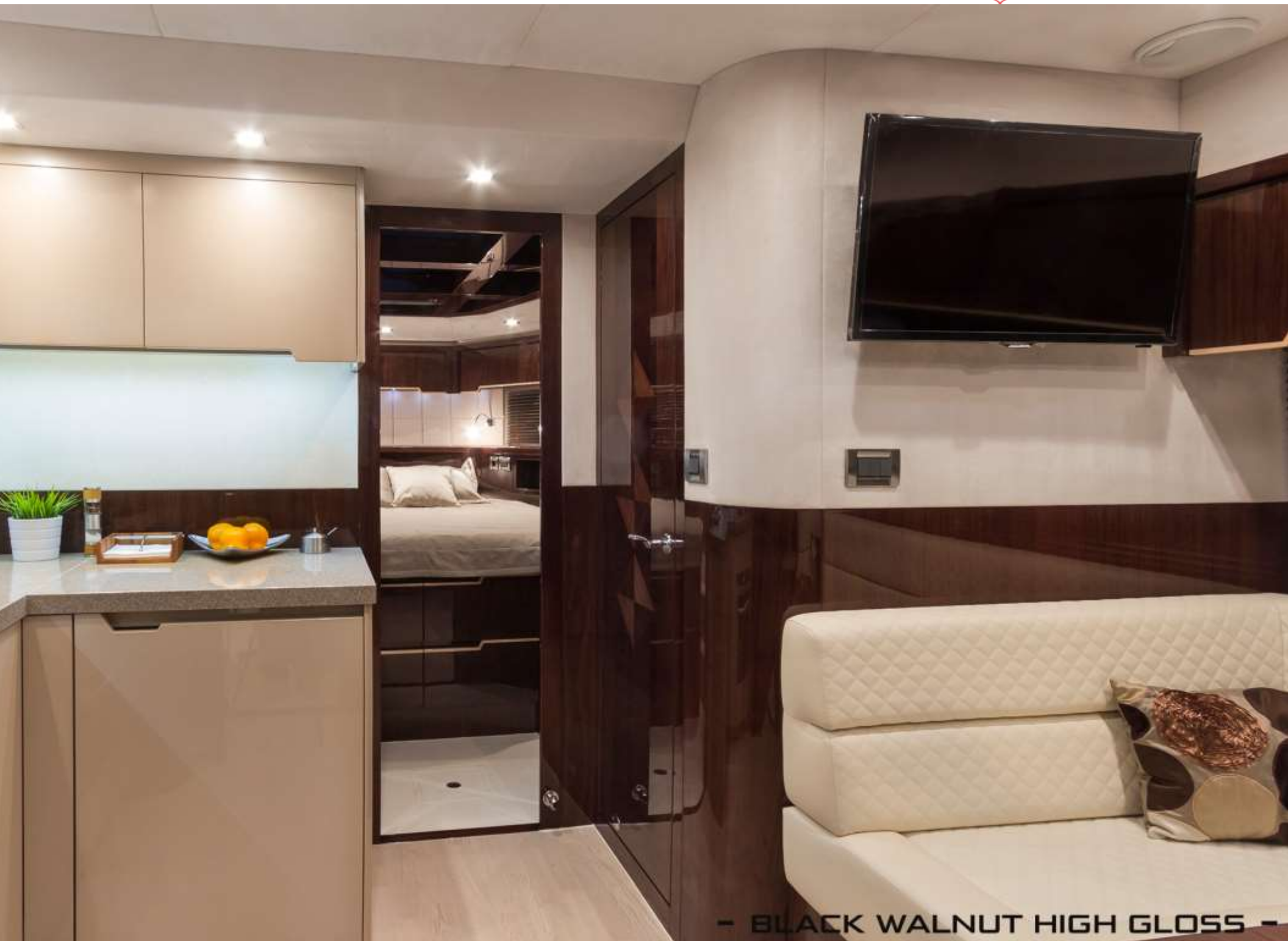
- BLACK WALNUT HIGH GLOSS -