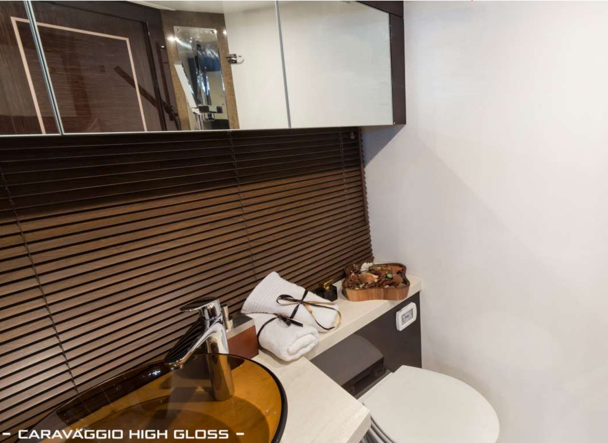
- CARAVAGGIO HIGH GLOSS -