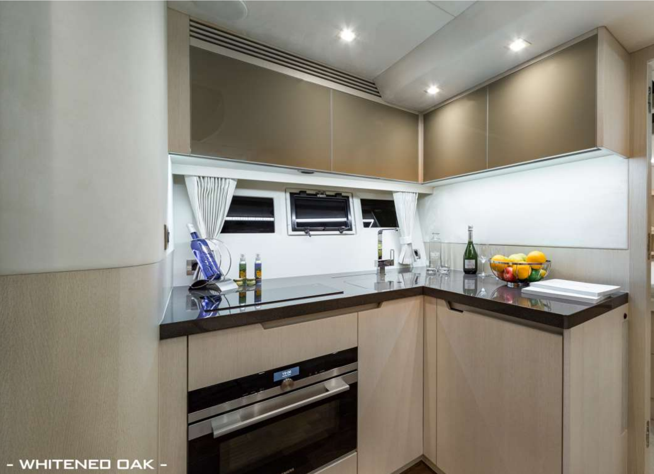
- WHITENED OAK -