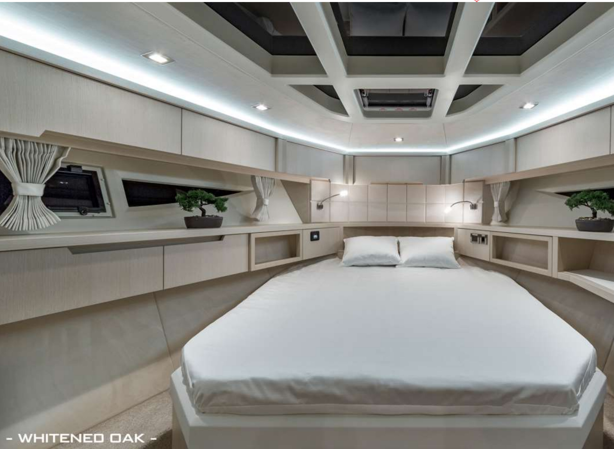
- WHITENED OAK -