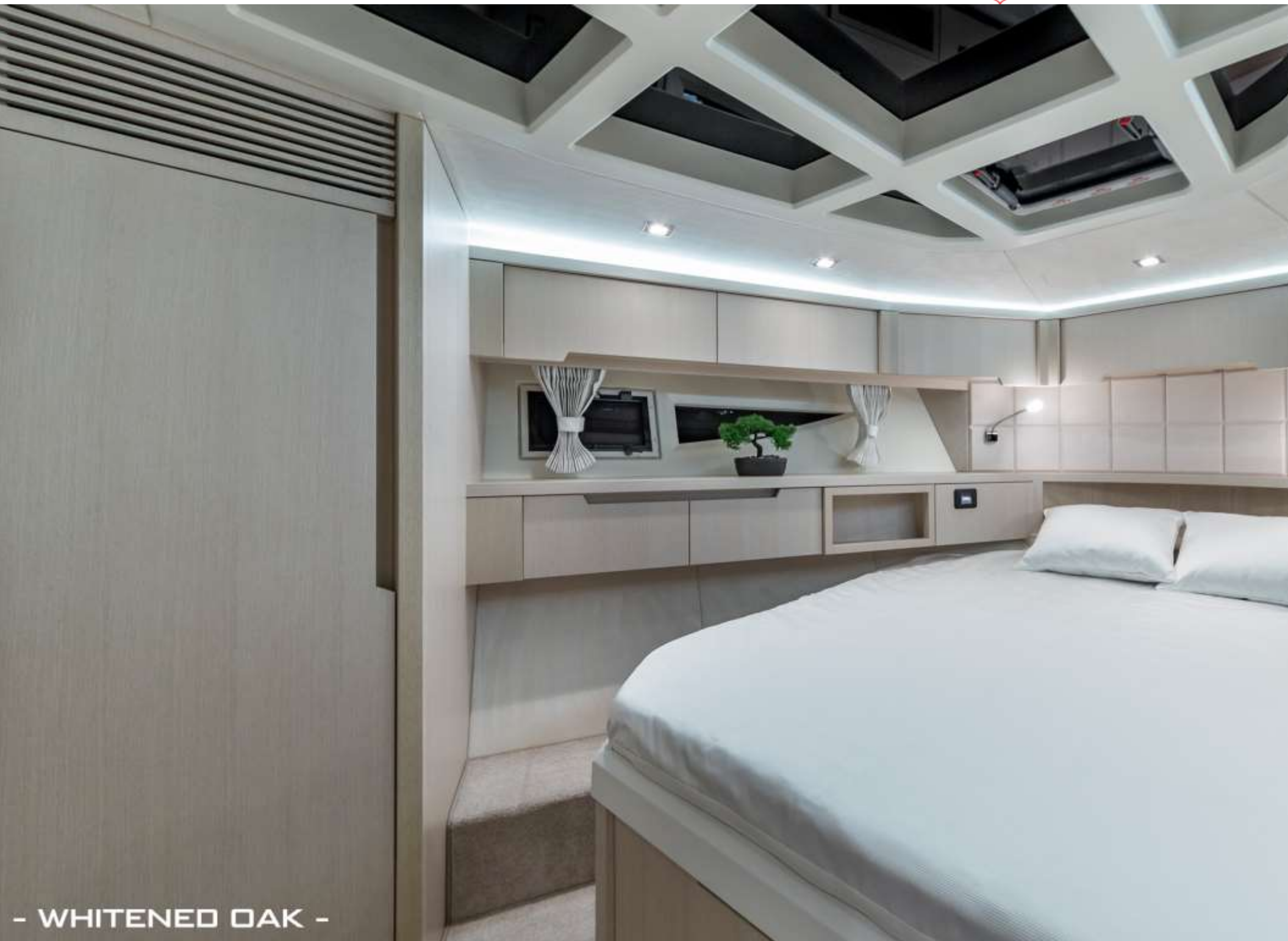
- WHITENED OAK -