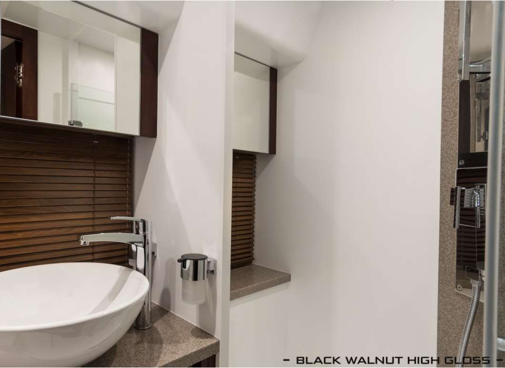
- BLACK WALNUT HIGH GLOSS -