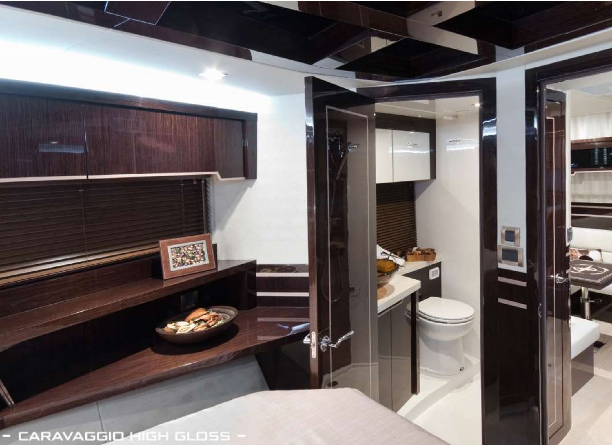
- CARAVAGGIO HIGH GLOSS -