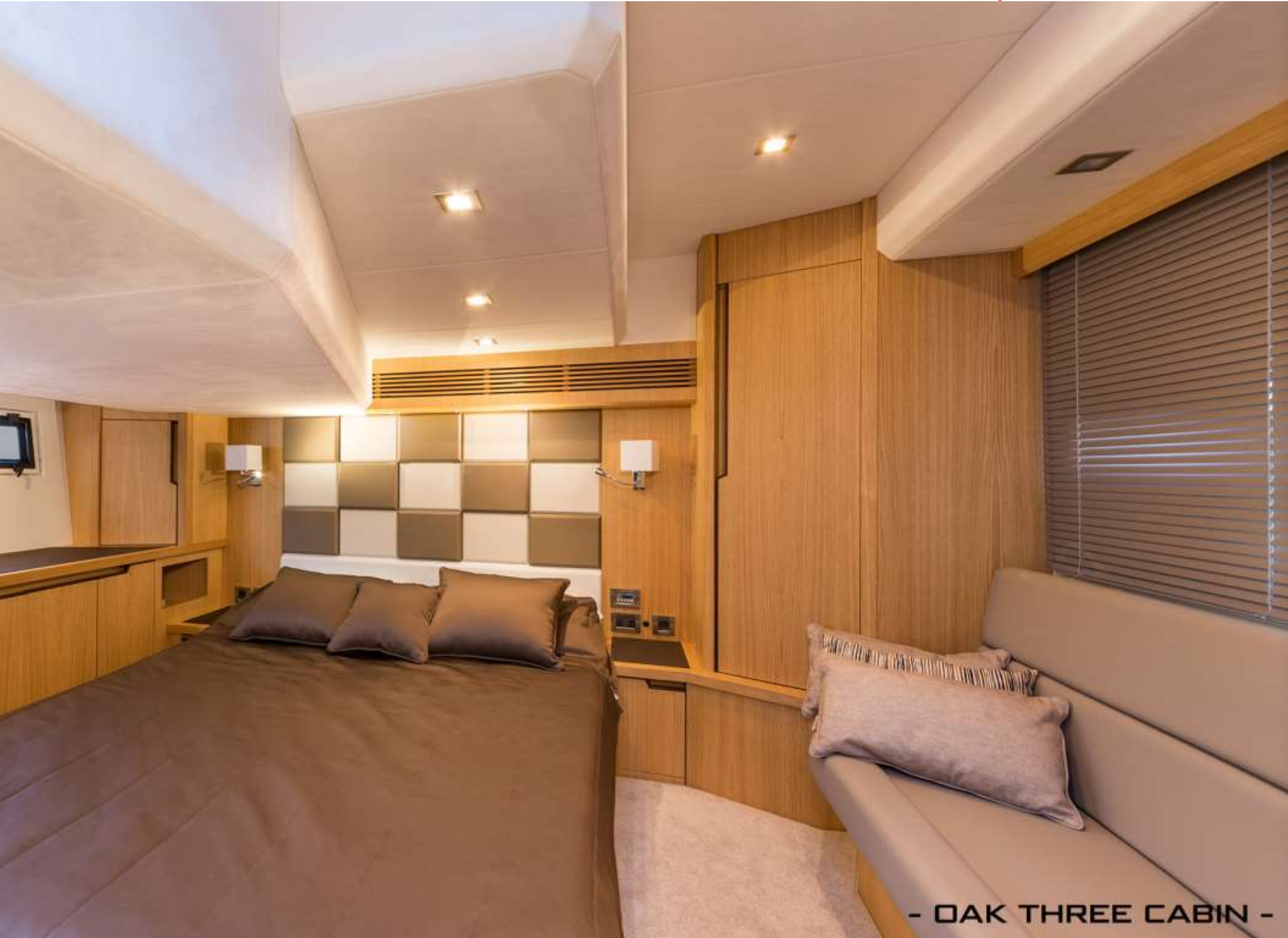
- OAK THREE CABIN -