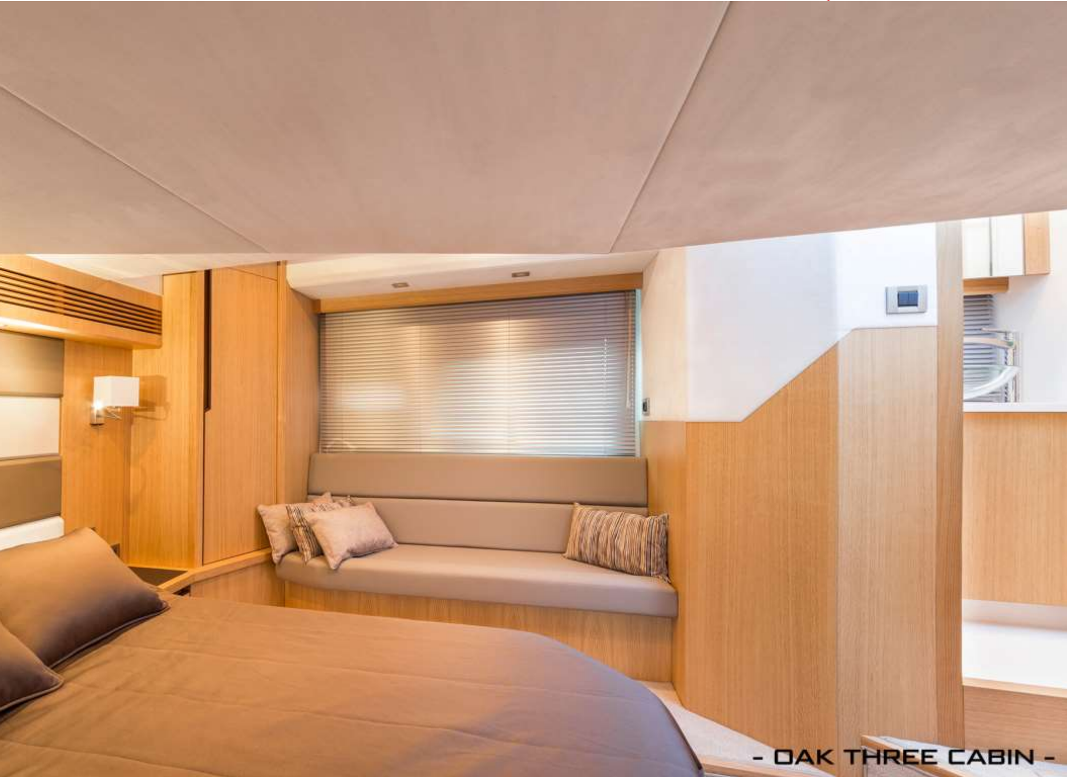
- OAK THREE CABIN -