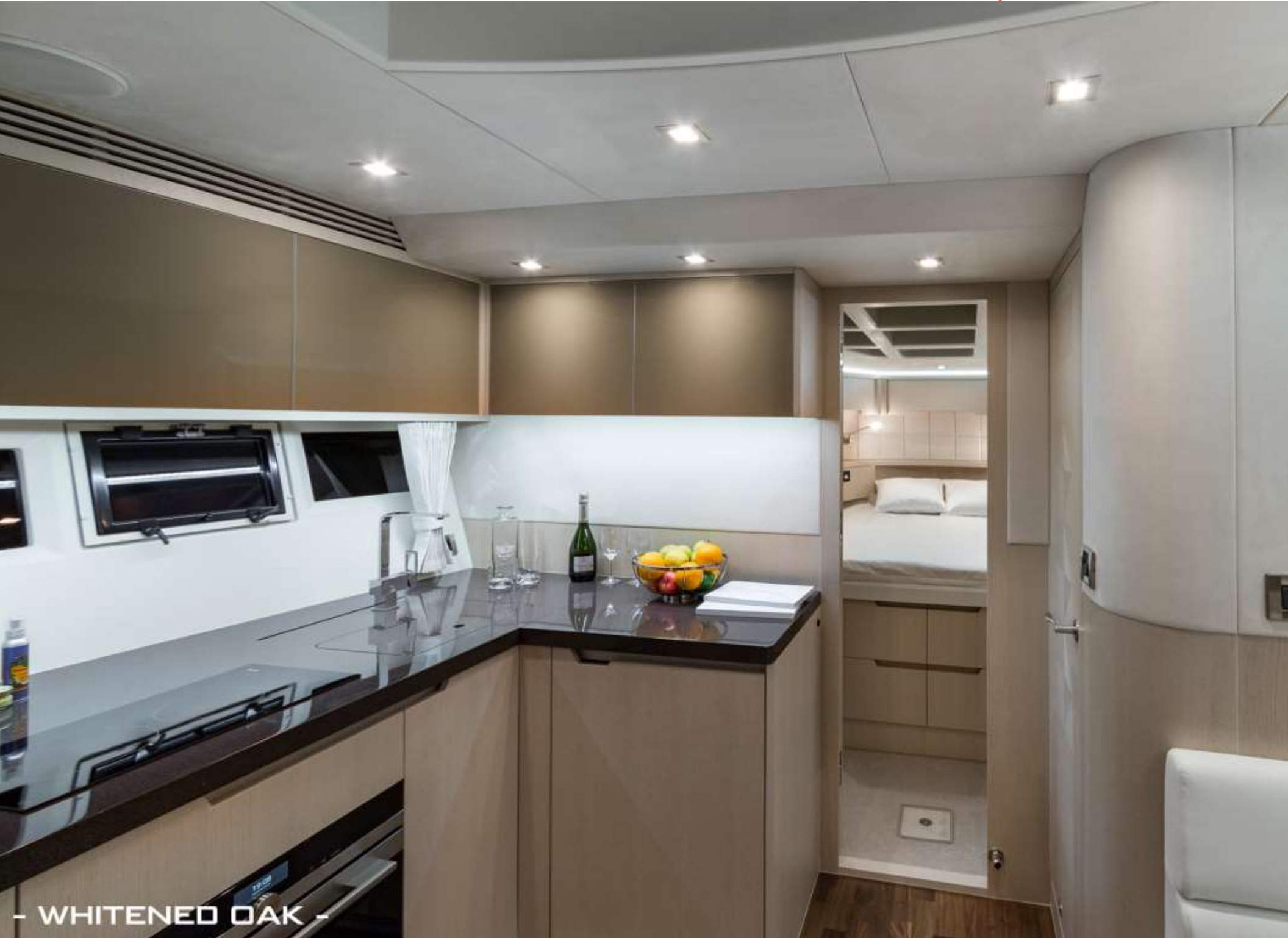
- WHITENED OAK -